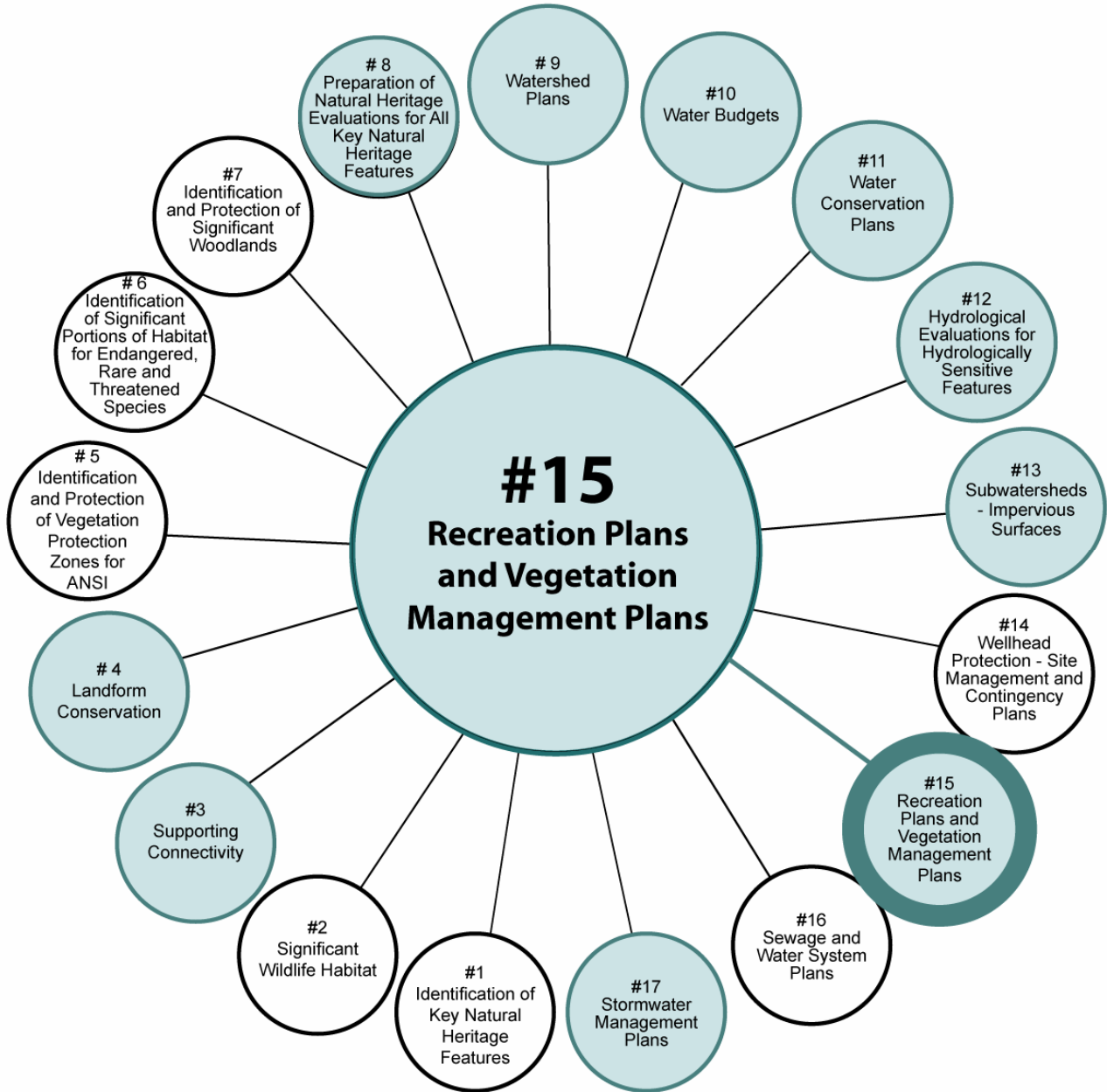
Figure 1 ORMCP Topic Areas and Linkages with Technical Paper 15 - Recreation Plans and Vegetation Management Plans