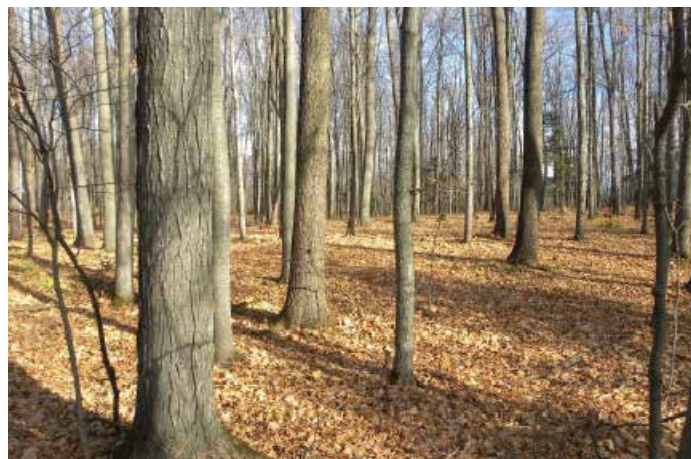
Upland, well drained, mature hardwood forest.

Right now, we are working on a map of all our properties, which we will share with you in our upcoming